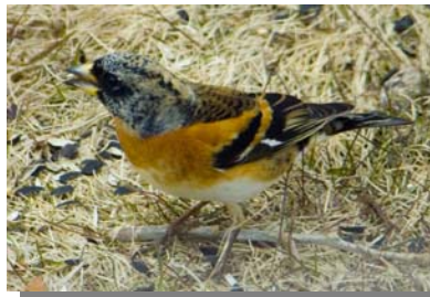
Taken through the windowpane between slightly lifted mini-blinds, this is among the first shots that I took of the Brambling.