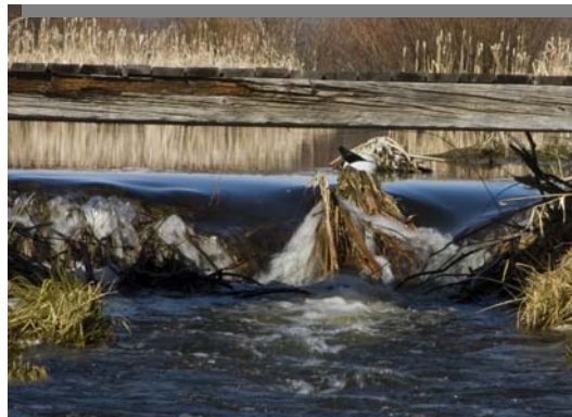
Red-winged Blackbird under a footbridge at Silver Creek on 4/19/06.