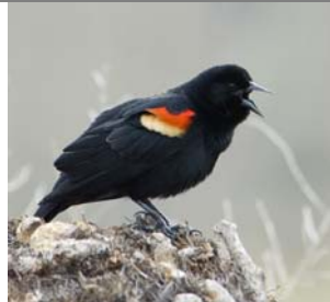
A Red-winged Blackbird singing his spring song.