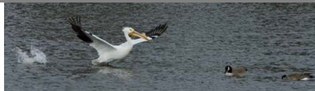
An American Pelican in fresh breeding plumage in Harri-man State Park, ID.