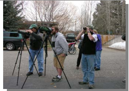
Hopeful visiting birders.

Next I placed a message on http://groups.yahoo.com/group/ible/Linked Electronically so that the members statewide would know about our Bellevue Brambling.