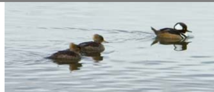
Three Hooded Mergansers on Henry's Fork of the Snake River peacefully floating along.