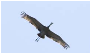
A Sandhill Crane soaring at about 100 feet over Loving Creek near the Silver Creek Preserve.