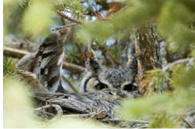
You know that spring is in full gear when you find a brooding Great Horned Owl.