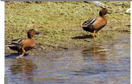
Rival male Cinnamon Teal engaged in a squabble over a female.