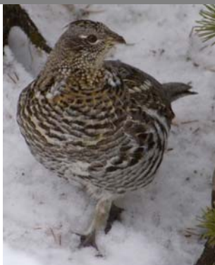
Ruffed Grouse, Island Park, Idaho.