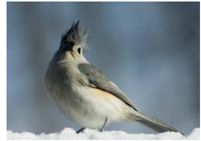
When a warm March breeze ruffled this Tufted Titmouse in Mahwah, N.J., Don King would have been jealous!