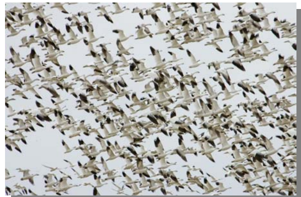
Just east of Terreton, Idaho, hundreds of migrating Snow Geese fill the overcast sky.

May 2, 2006 a housing development across 300 square miles of south-east England has been halted to protect three rare bird species; Dartford Warbler ( Sylvia undata ), Nightjar ( Caprimulgus europaeus ), and the Woodlark ( Lullula arborea ). Source; The Independent Online