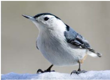
White-breasted nuthatch. Mahwah, N.J.