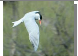
Field marks to look for when identifying the Common Tern are: dark wedge on primaries (not visible in this shot), orange-red bill with dark tip (dark tip is often lost July-Sept.), and the gray body blending with the gray back. Snake River, near Buhl, Idaho.