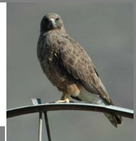
From its perch on a wheel line, this first year Swainson's Hawk will not miss a scurrying field mouse.