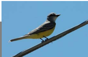
Just outside the gates of the San Ygnacio Bird Sanctuary a Couch's Kingbird perched on a utility wire.