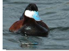
From March to August the Ruddy Duck's breeding plumage, distinguished by its bright blue bill and cinnamon body, makes it a stand out in any marsh. Market Lake WMA, Idaho.