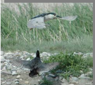
At Market Lake in eastern Idaho an American Coot chases a Black-crowned Night-Heron out of its territory and away from its young.