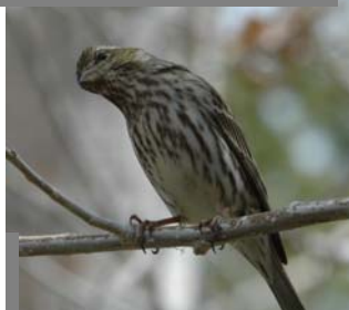
A female Cassin's Finch.