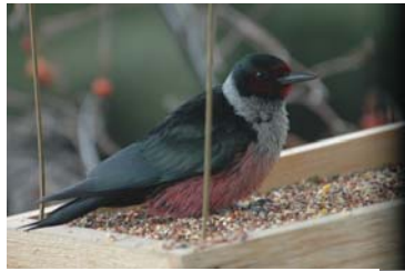
Lewis's Woodpecker, May 6, 2005, visits the seed feeder in my front yard. This photo was taken through the window.