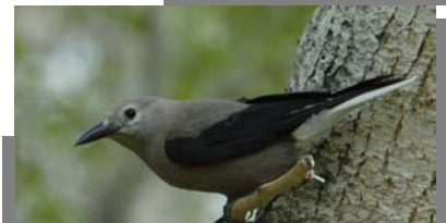
In Hailey, Idaho, a Clark's Nutcracker takes a break above a backyard feeder.