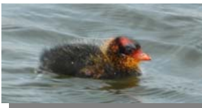
An American Coot chick floats effortlessly in the main canal at Market Lake.