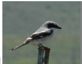
The broad black mask and short stubby bill are two of the field marks that differentiate the Loggerhead Shrike from the Northern Shrike.