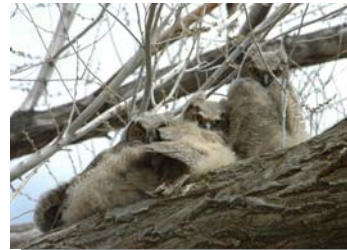
Here are three wary Great Horned Owl chicks on Picabo Road south of Bellevue during the branching phase of the fledging process.