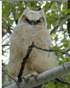
Near the Stockard Road bridge in the Silver Creek Preserve, one of three Great Horned Owl fledglings observes me as I snapped its picture. Picabo, Idaho.