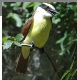
A Great Kiskadee at the Santa Ana, NWR, Texas.