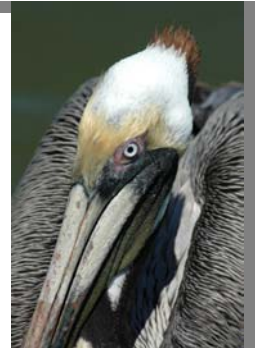
A close-up view of an Atlantic race Brown Pelican in breeding plumage, Texas.