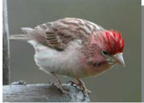
A male Cassin's Finch eyes a feeder from his rainy day perch.