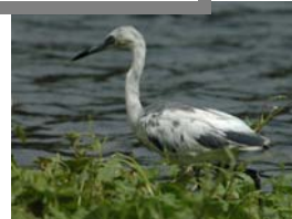
The mottled, dark gray feathers emerging on this Little Blue Heron identify it as a first spring bird. Silver Springs, Marion County, Florida.