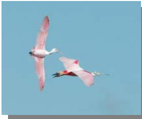
Roseate Spoonbills soar over Aransas Bay, Rockport, Texas.